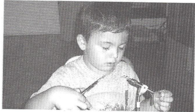
Boy Fly Tying at 2009 Youth Day

ITY Program, Indiana's voluntary quality rating and improvement system for the third year. The centers have achieved this award by meeting the following requirements: promoting positive relationships for all children and adults, using a planned curriculum to help your child develop his or her language, physical, social/emotional, and thinking skills, using materials and teaching that consider your child's developmental needs, as well as his or her cultural background, providing ongoing assessment of your child's learning and development and communicating his or her progress to you, and promoting children's health and protecting your child from injury and illness. Growing Kids decision to participate in this program is great news for your child because research shows that high quality early learning experiences prepare children for success in school, work and life.